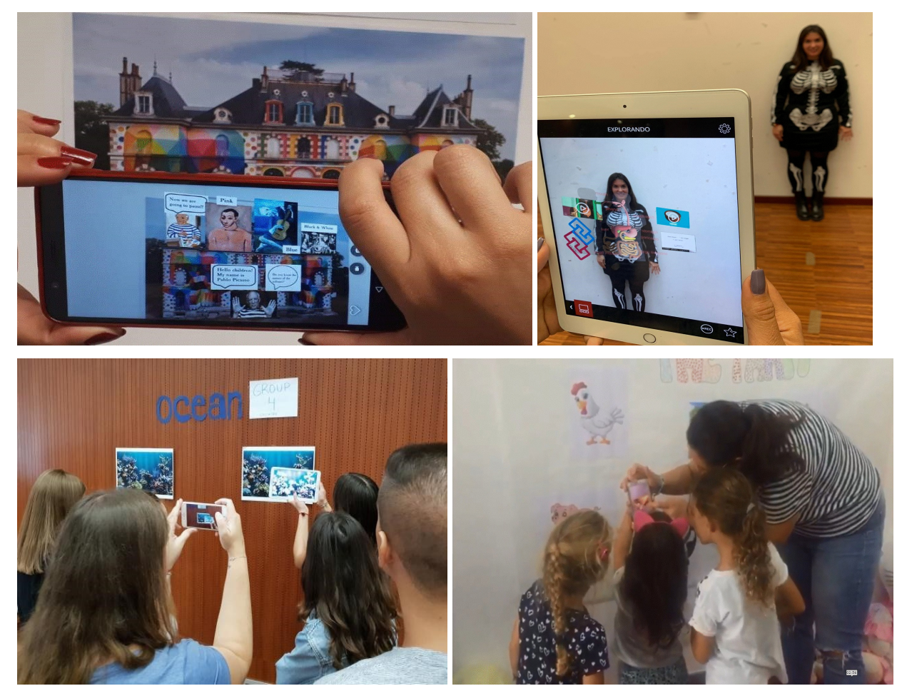
Figure 4. AR projects. From top left to bottom right: Art and museums (poster), The Digestive System (costume), AR project presentations (Ocean poster), AR project implementation with children (Farm animals mural).

The AR projects developed by the teacher candidates used three types of trigger elements, which needed to be closely related with the main topic of their English lesson: posters or murals, costumes and real-world objects, as illustrated in Figure 4.