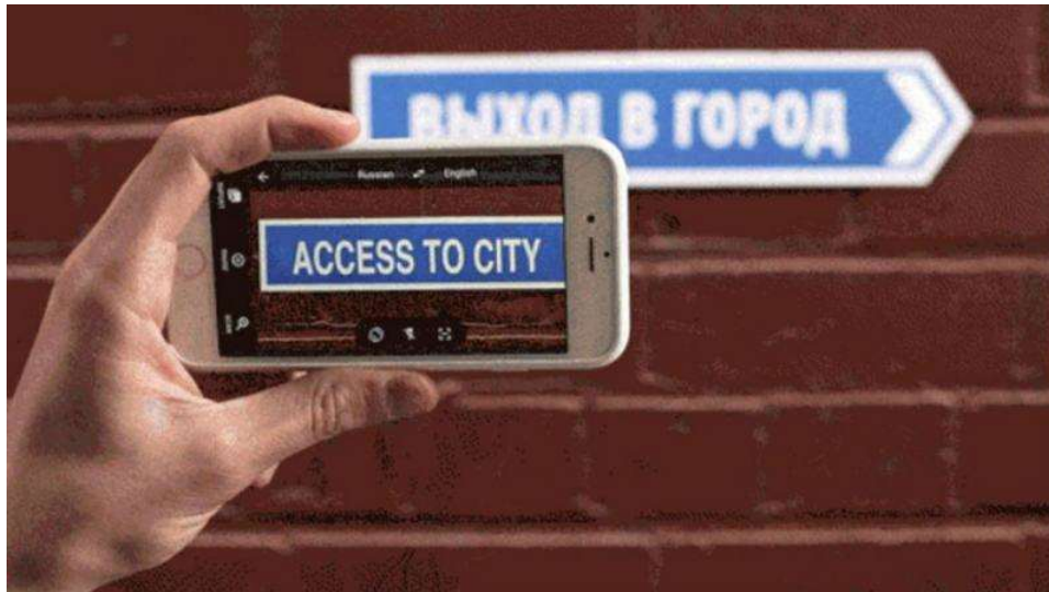
Figure 3. Google Translate

merely by pointing a smartphone camera at a foreign language sign and translating it in a way that visually matches the fonts and colors of the original image (see Figure 3).