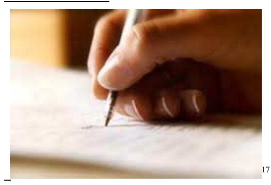
Ex. 10. Go through the checklist below to find out if your essay was written correctly. Put a tick (V) or a cross (X) on the right. Then, correct the essay (if sth was wrong):

Ex. 9. Using the ideas and the language (words and expressions) collected while going through different stages of this EAPQuest, write an essay entitled "The advantages and disadvantages of taking part in talent shows." Use 180-250 words.